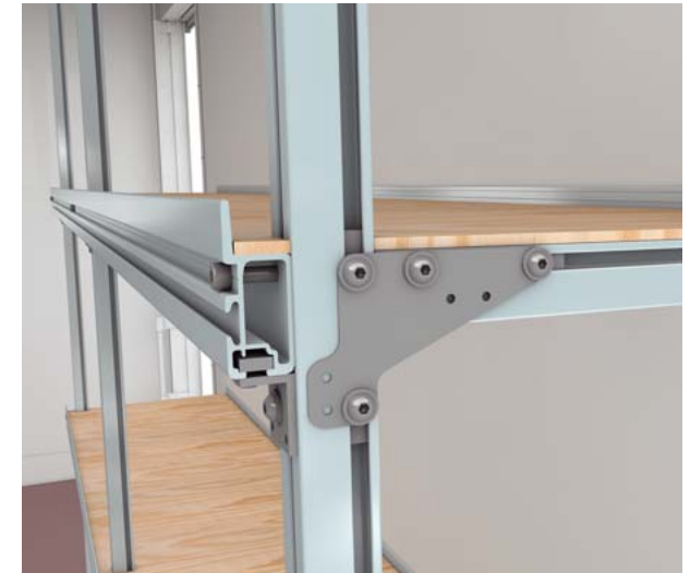
The new storage system: GETO Shelf