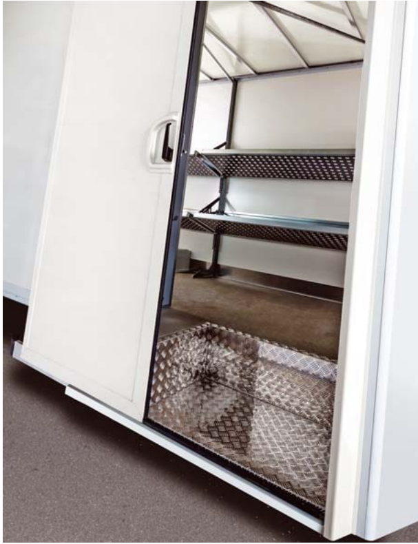
Available with sliding side door and recessed step