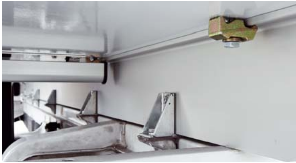
Longitudinal member connected to self-supporting floor and chassis