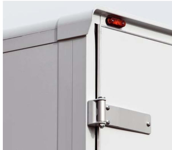
Fitted with top lights

The perfect fit for tradesmen, florists or bakers, or universal transport on own account is GETO Shelf, the universal shelf system for body kits and 3.5 t box vans. GETO Shelf can be fitted to side walls at an angle of up to 20°. Much like the Lego system, the basic elements (floor, wall and ceiling profiles) affix to connecting elements (horizontal and vertical posts). With GETO Shelf, any application can be realised.